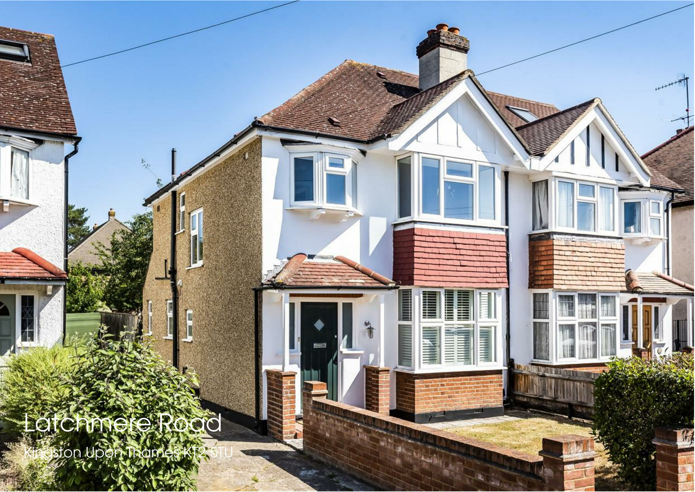
Latchmere Road Kingston upon Thames KT2 5TU